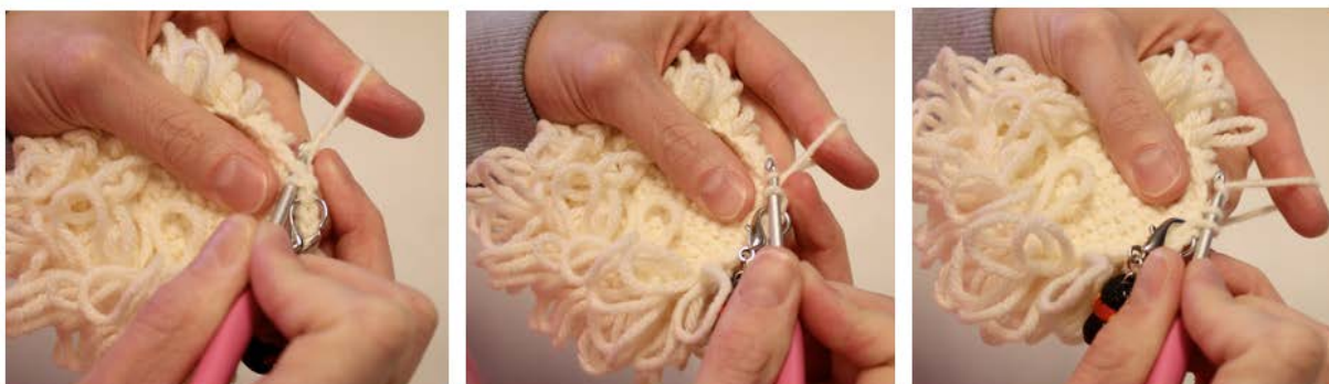
Normal front side of work... loop stitch front side of work