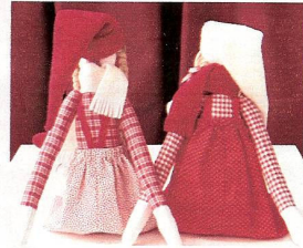
Finished doll size: About 60cm tall.