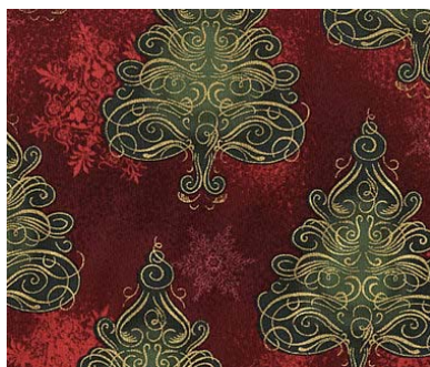
HOLIDAY SPLENDOR ORNATE CHRISTMAS TREES SCARLET AND GOLD