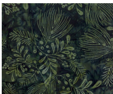
SEASONAL BATIKS H2321-60-HUNTER