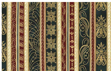
HOLIDAY SPLENDOR SCROLLING STRIPE CHRISTMAS AND GOLD