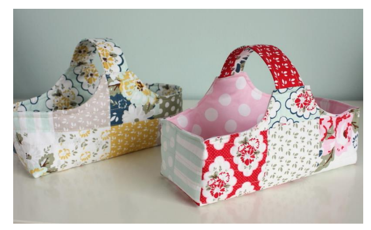
This will give the basket a little more of a box-y look. Either is fine!

camouflage the stitches. Repeat at all four corners.