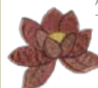
FS-AF41 3.3" W - 3.0" H