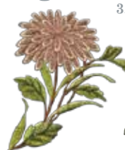
FS-AF25 5.3" W - 4.7" H