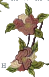
FS-AF19 3.9" W - 6.5" H