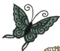
FS-AF3 5.8" W - 4.8" H