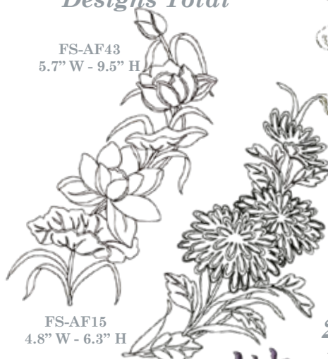
FS-AF43 4.8" W - 9.5" H