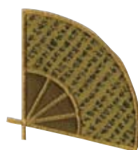
FS-AF16B 4.6" W - 4.8" H