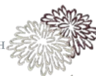
FS-AF13 4.5" W - 3.4" H