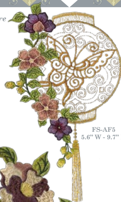
FS-AF5 5.6" W - 9.7" H