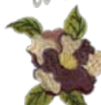
FS-AF20 3.3" W - 3.7" H