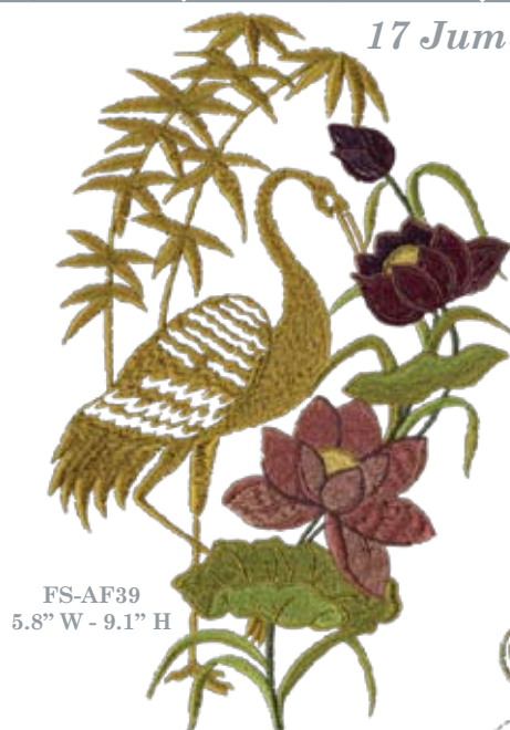
FS-AF39 5.8" W - 9.1" H