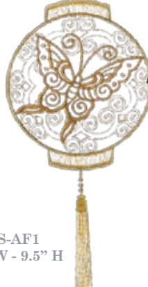
FS-AF1 4.7" W - 9.5" H