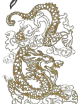
FS-AF10 4.8" W - 6.8" H