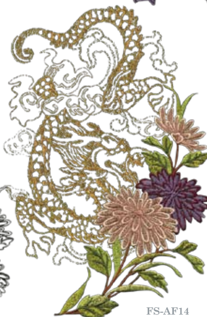
FS-AF14 5.8" W - 8.7" H