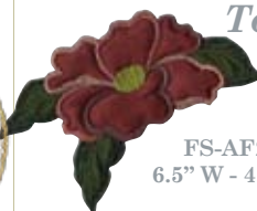
FS-AF27 6.5" W - 4.7" H