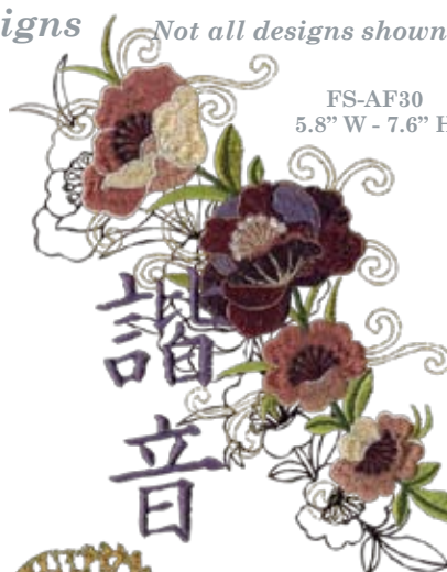
FS-AF30 5.8" W - 7.6" H