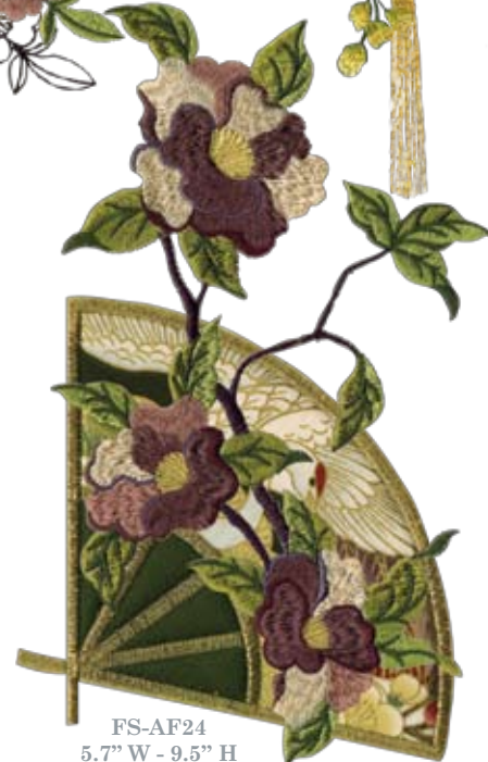
FS-AF24 5.7" W - 9.5" H