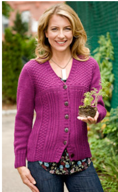
rollover to enlarge