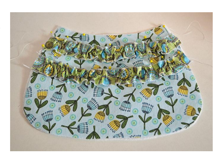
Step 4: Take your front purse piece and measure down from the top 1 ¼ inch. Mark both the left and right sides. Measure down 1 ½ inch and mark again on each side. Gather your ruffles to the width of the purse and place the center gathering stitch on your ruffle pieces on top of your measurement marks. Follow the curve of the purse so the ruffle is always the same distance from the top. Stitch your ruffles to the purse front by sewing just next to the gathering stitch. Pull out the gathering stitch.