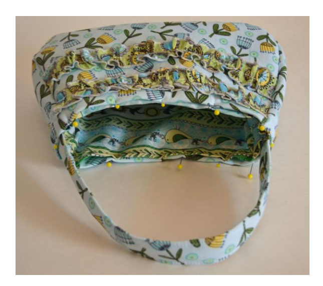
Step 8: Turn your purse outer right side out, pushing out the seams. Tuck the lining inside the purse outer, wrong sides of fabric facing. Line up the side seams. Take your strap piece and insert it at the side seams, tucking it in ½ inch on each side. Carefully pin all the way around the purse top, matching up the edges and the seams. Topstitch using a 1/8 inch seam allowance.