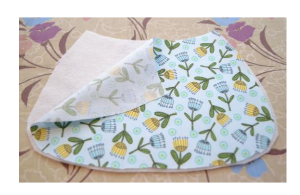
Step 2: Iron on interfacing to wrong side of outer fabrics (front, back, bottom, strap).

Cut Interfacing for each outer fabric piece.