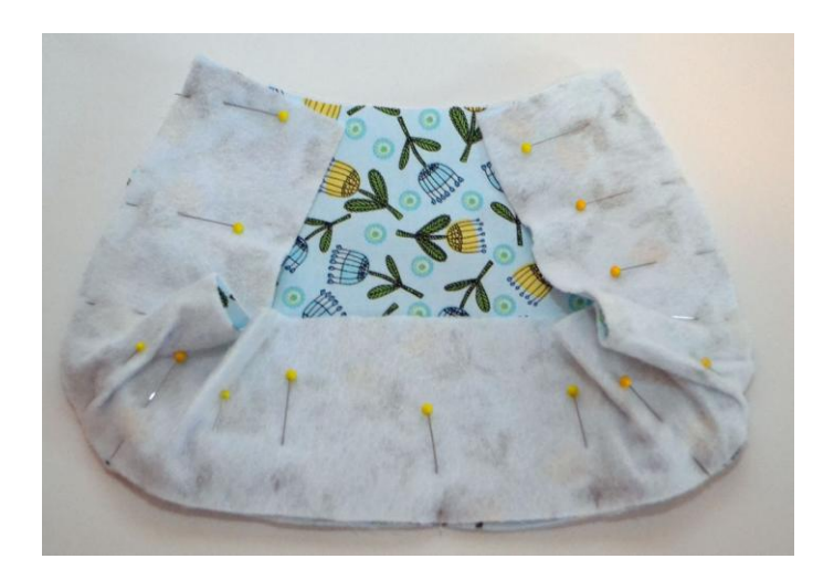
Step 5: Pin your purse bottom to the purse front right sides together. Sew. Repeat with the lining.