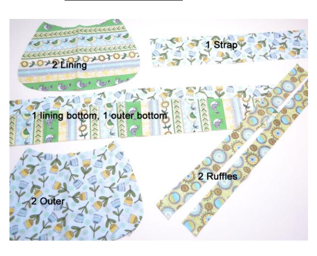
Step 1: Cut out your pattern pieces and tape where needed. Place on the fabric and cut as directed in the cutting chart. When you are finished you should have a pile similar to this: