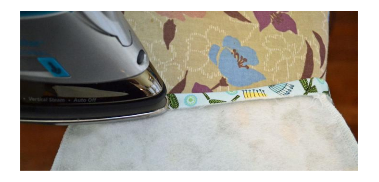
Step 7: Your purse outer piece should still be inside out. Turn the top down ½ inch towards the wrong side all the way around and press. Repeat with the purse lining.