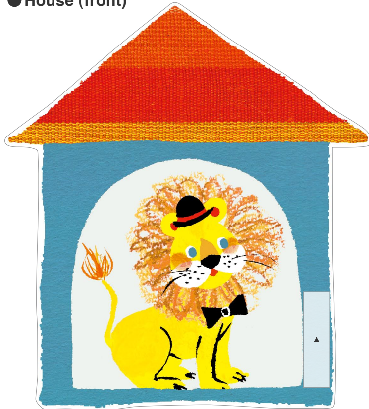
● House (front)