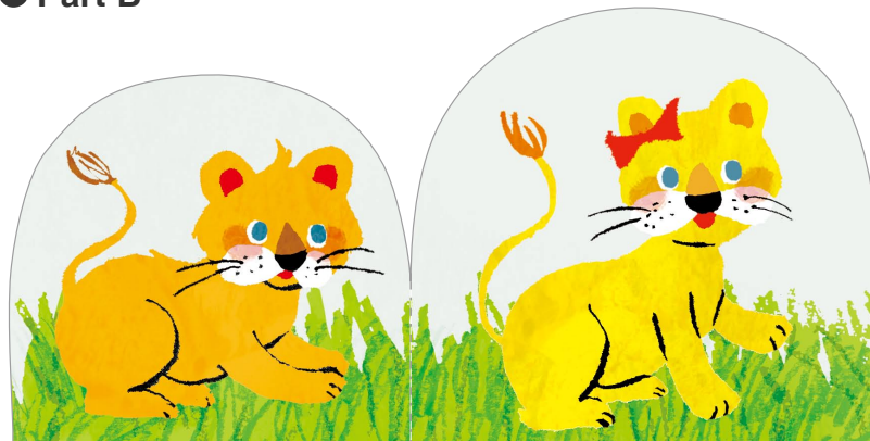
● Part B