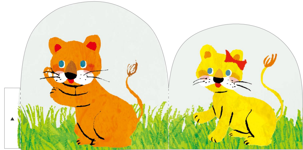
● Part A