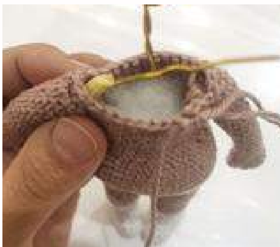
insert the wire in first hand

Cut about 25 cm and bend the end of the wire stick the wire with insulating tape and follow the pictures.