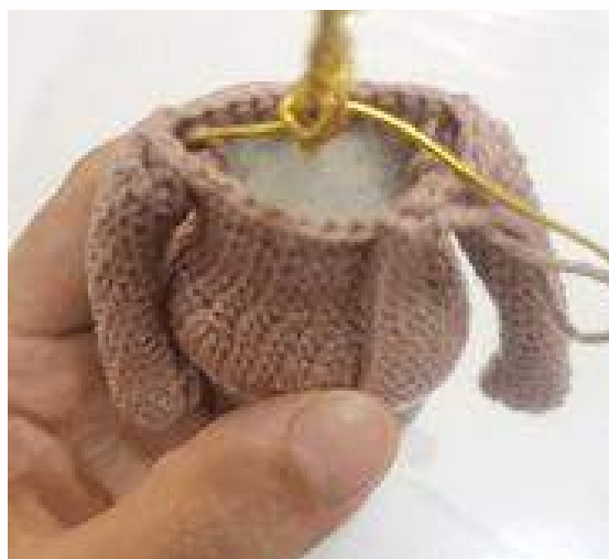
Wrap the wire more than once